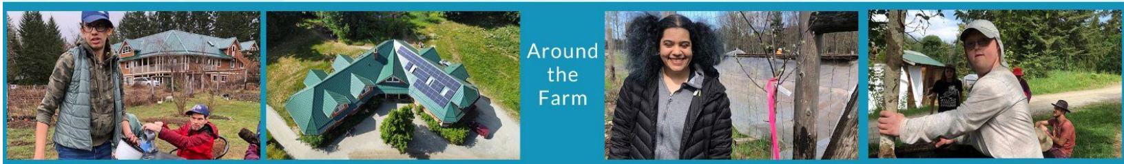
Around the Farm